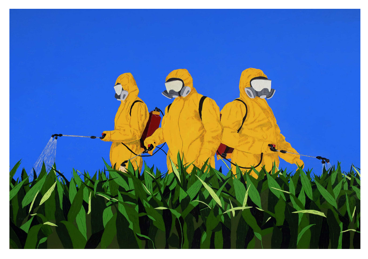
Image: Osvaldo Carvalho, Cárites , 2020.

The pioneering Brazilian painter Osvaldo Carvalho was chosen to launch the Embassy of Brazil's contemporary art programme, presenting works in vibrant colours to convey an acute social commentary in his first solo show in the UK.