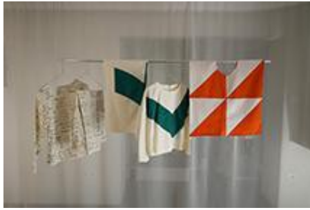
Chrysanthi Koumianaki When the Performance Ends , 2023 Installation, quadrilateral folding screen (205 × 324 cm), costumes of various dimensions, sound installation, 8'48" loop EMΣT new production Courtesy of the artist Photo: YOOOP Studio