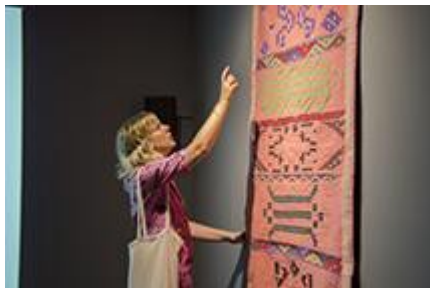
Maria Varela Rugs of Life , 2020 Installation, two handmade rugs (185 × 103 cm and 191 × 91 cm), black & white video, no sound, 5' loop Produced in collaboration with the Twanza Cooperative Courtesy of the artist Photo: Anna Primou