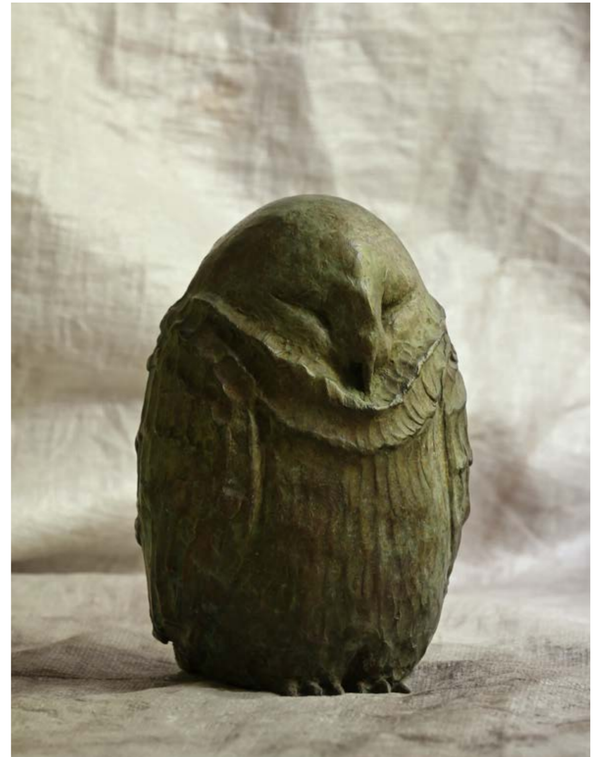
Athene Noctua , 2022 Signed and dated 'H.K.D.R. 2/8 2023' Bronze with vert de gris patina 20 x 16 x 15 cm (7 \frac{7}{8} x 6 \frac{1}{4} x 5 \frac{7}{8} in.) Edition of 8 plus 2 artist's proofs (#2/8)