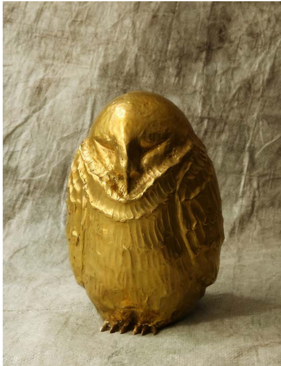
Athene Noctua , 2022 Bronze gilded with 24 carat gold 20 x 16 x 15 cm (7 \frac{7}{8} x 6 \frac{1}{4} x 5 \frac{7}{8} in.) Edition of 8 plus 2 artist's proofs (#1/8)