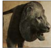
Apademak 2023 (#1/8)