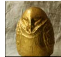
Athene Noctua 2022 (#1/8)