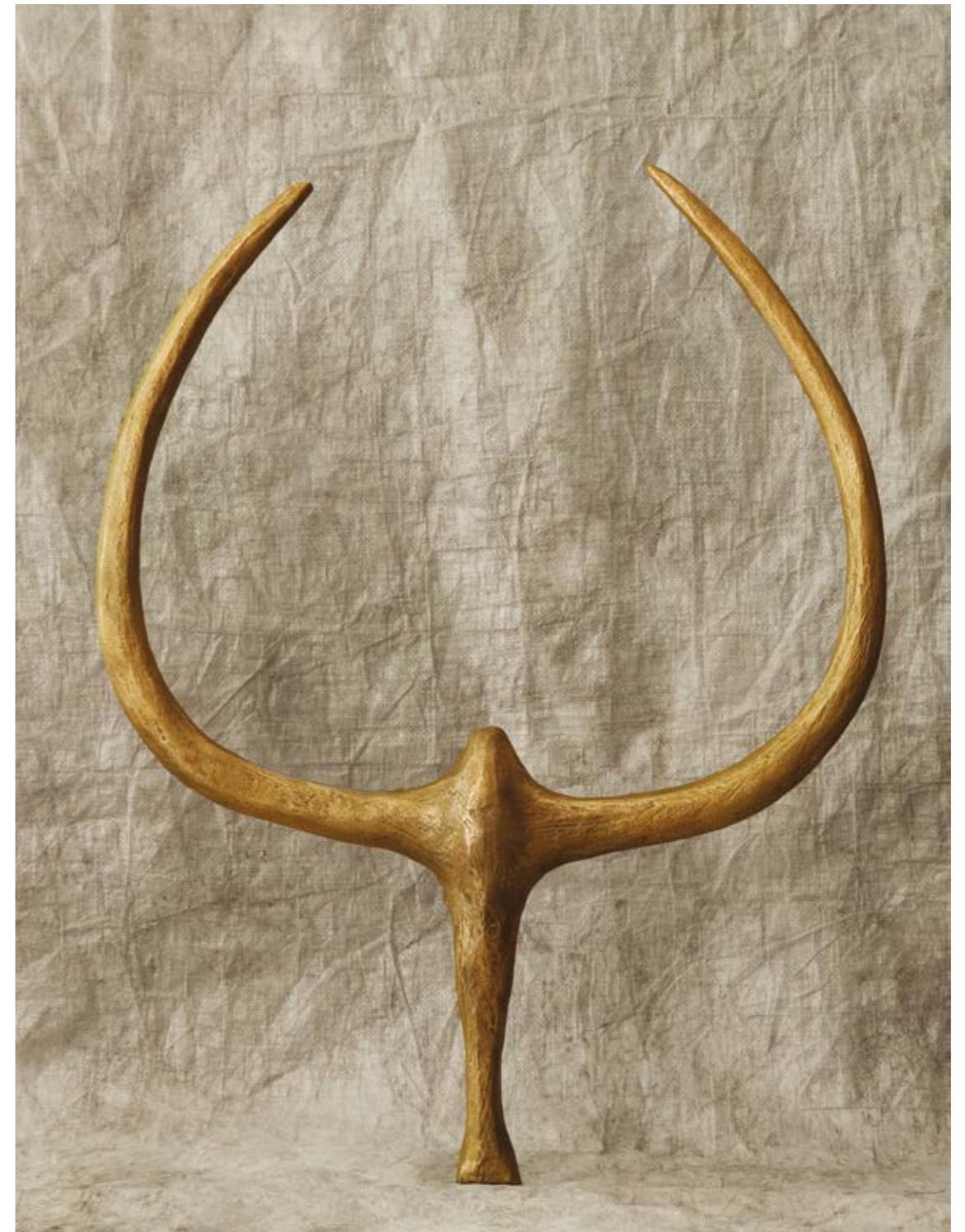
Rereroa , 2022 Bronze 70 x 55 cm (27½ x 21⅝ in.) Edition of 8 plus 2 artist's proofs (#2/8)