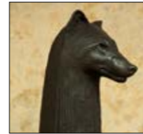
Moquwaio II (Tail Right) 2022-23 (#1/3)