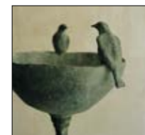
Three Birds 2022 (#3/8)