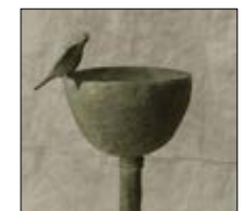
Single Bird 2022 (#3/8)