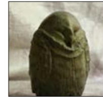
Athene Noctua 2022 (#2/8)