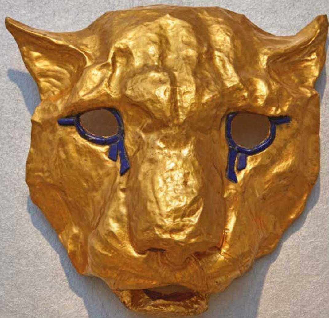
Cusco, 2017 24 carat beaten gold and lapis lazuli 25 x 20 cm (9 7 / 8 x 7 7 / 8 in.)