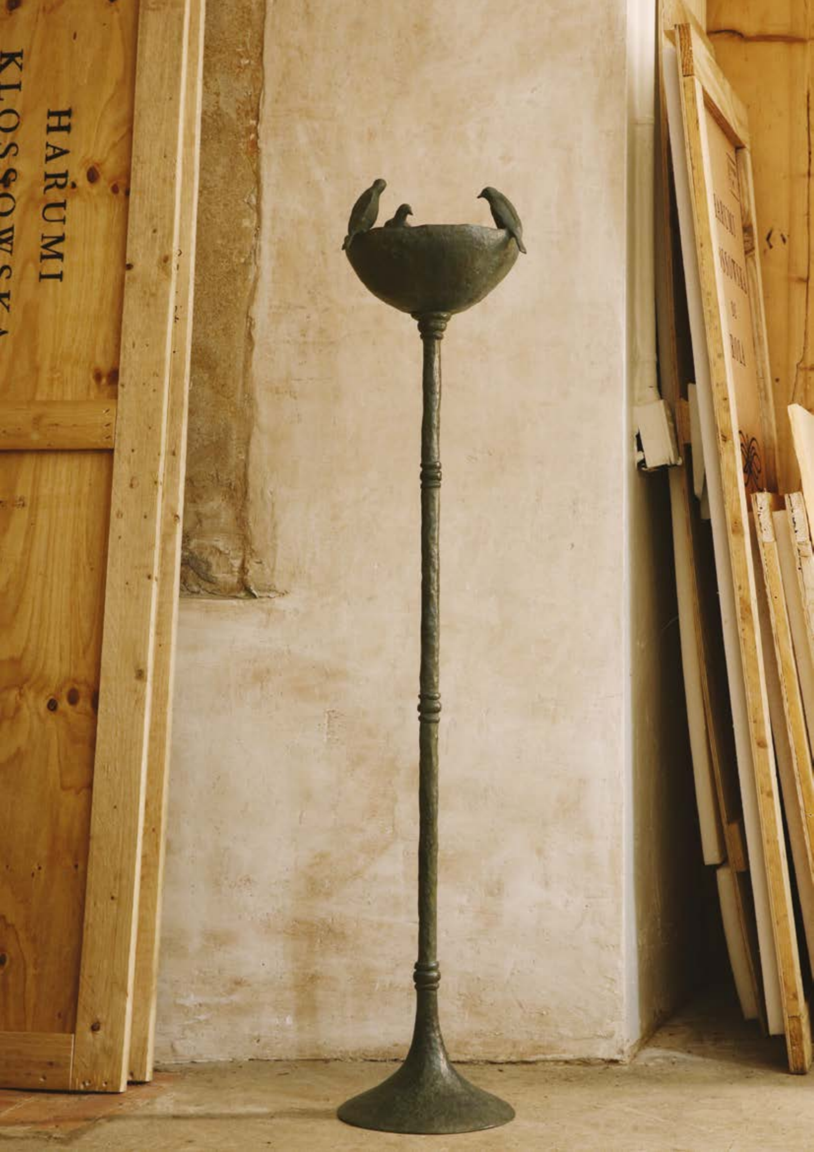
Three Birds, 2022 Bronze 158 x 32 cm (diameter at top) (62¼ x 12¾ in.) Edition of 8 plus 2 artist's proofs (#6/8)