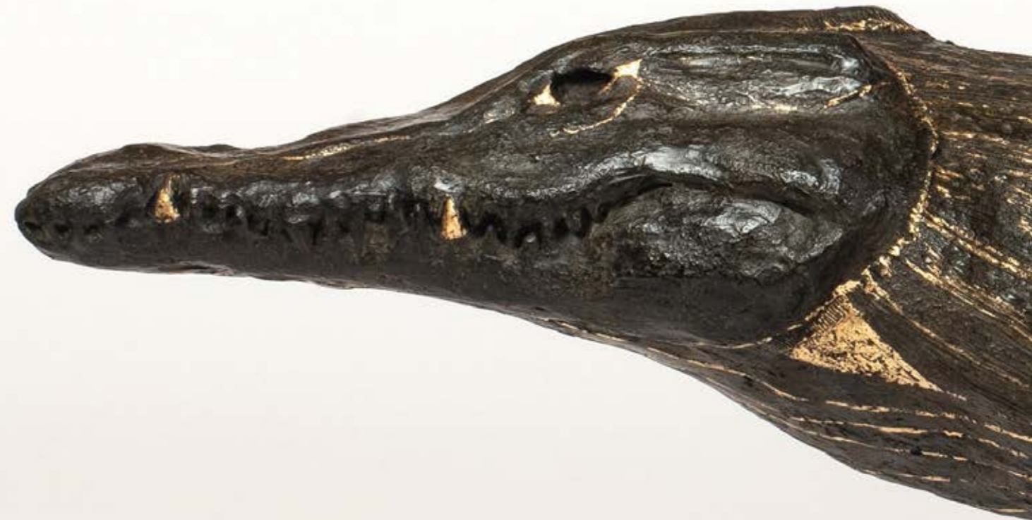
Sobek, 2022 Bronze with dark brown patina, gilded with 24 carat gold 43 x 55 x 206 cm (16 \frac{7}{8} x 21 \frac{5}{8} x 81 \frac{1}{8} in.) Edition of 3 (#2/3)