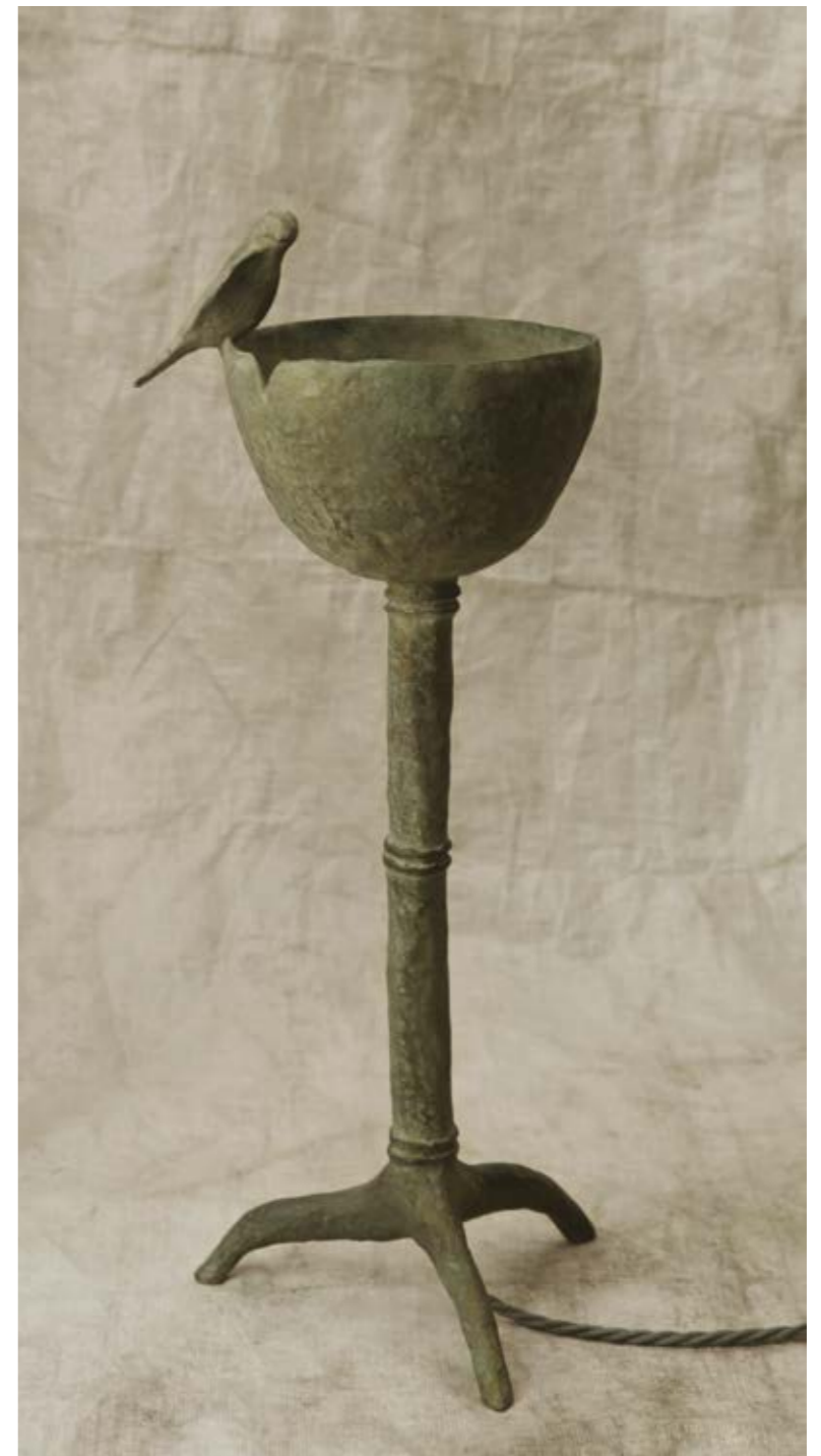
Single Bird, 2022 Signed 'H.K.D.R. 3/8' Bronze 53.7 x 21.5 cm (diameter of base) (21⅞ x 8½ in.) Edition of 8 plus 2 artist's proofs (#3/8)