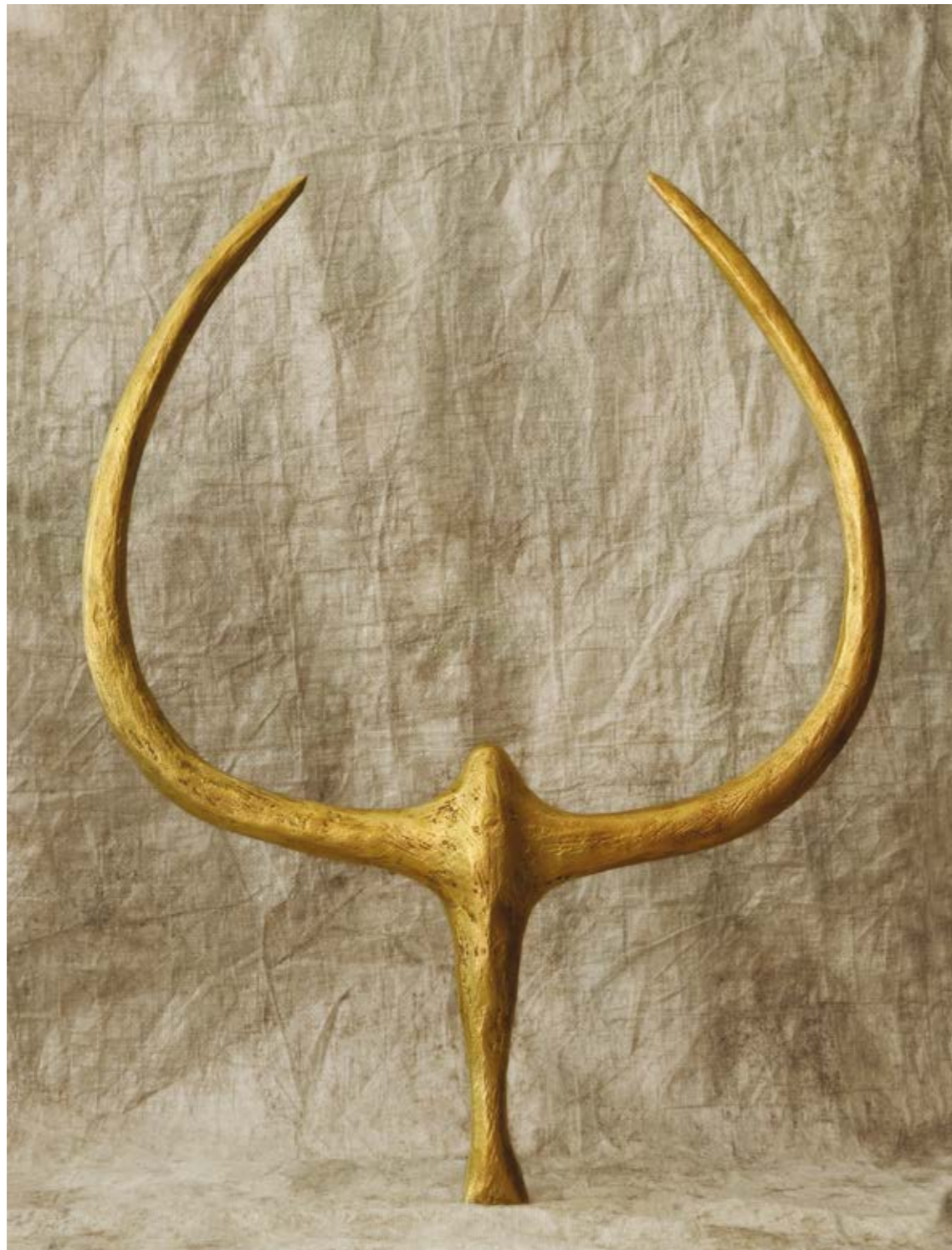
Rereroa , 2022 Gilded bronze 70 x 55 cm (27½ x 21⅝ in.) Edition of 8 plus 2 artist's proofs (#1/8)