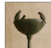
Three Birds 2022 (#6/8)