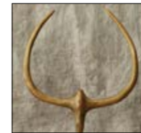
Rereroa 2022 (#2/8)