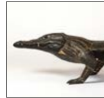
Sobek 2022 (#2/3)