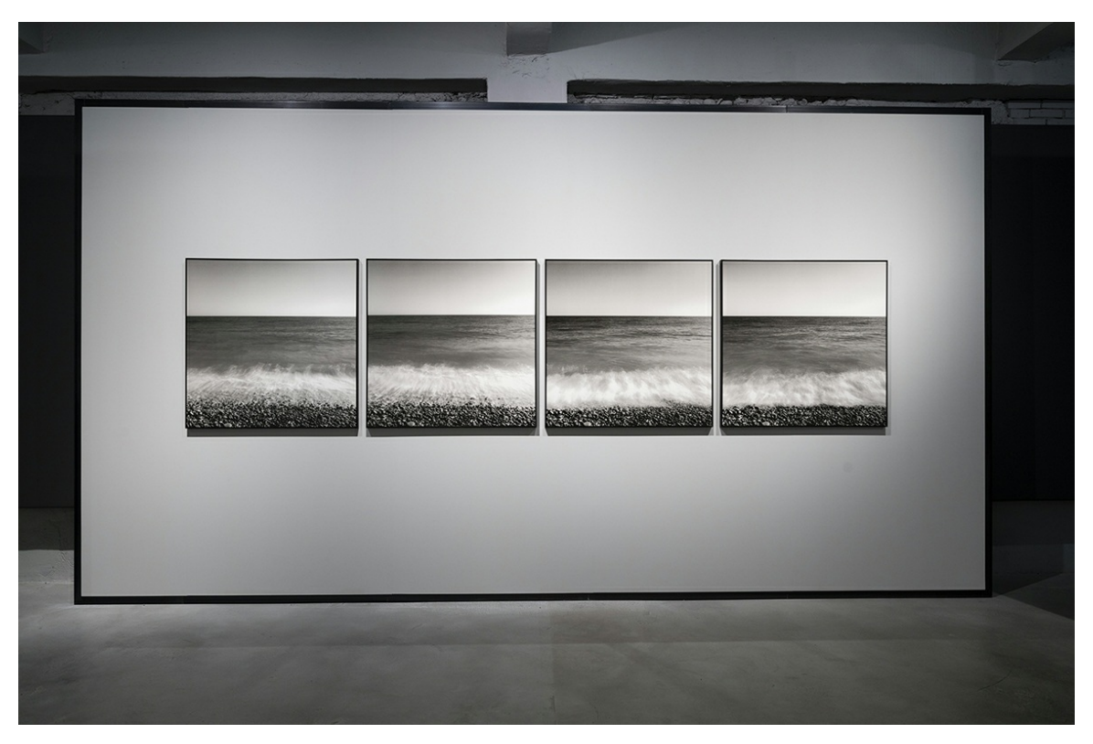
Image: Mimmo Jodice. Senza Tempo, installation view at Gallerie d'Italia, Turin, 2023.