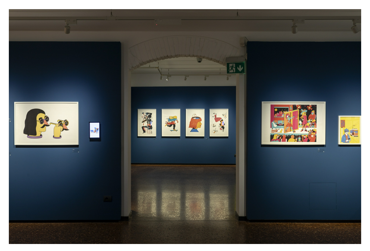
Image: EX-Illustri x Elena Xausa , 2023, installation view at Gallerie d'Italia Vicenza.