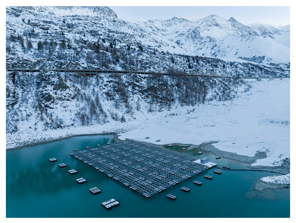
Image: Lac des Toiles - Switzerland, 2022 © Luca Locatelli. Courtesy of Intesa Sanpaolo.

Gallerie d'Italia Piazza San Carlo, 156 Turin <u>www.gallerieditalia.com</u> <u>Facebook | Instagram</u>