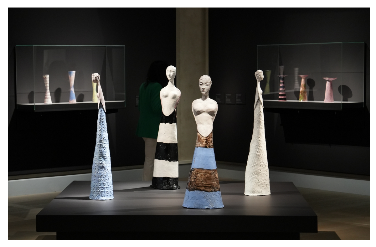
Image: Una collezione inattesa. Installation view at Gallerie d'Italia, Milano © Duilio Piaggesi. Courtesy of Intesa Sanpaolo.