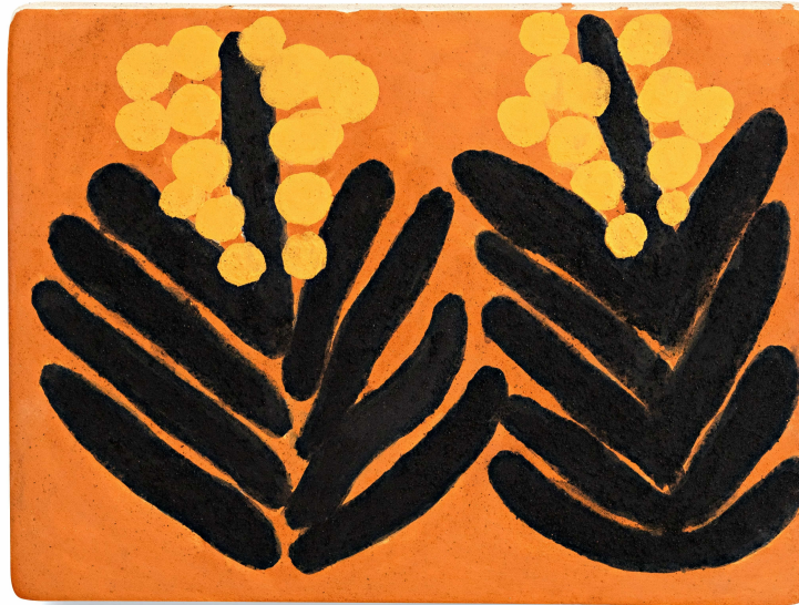
Solange Pessoa Untitled/ Sem titulo , 2023.

Earthworks features a selection of earth and fresco paintings, ceramic sculptures, and one video relating to Solange Pessoa's enduring relationship to land and spirited use of organic materials. Multifarious and experimental in its approach to material, Pessoa's oeuvre is at once transgressive and cohesive—in a league of its own determination. Though drinking from a well of cultural references—including Brazil's Tropicalia and Antropofagia movements, Indigenous craft, the Baroque, Land Art, and her own dreams—her peerless approach is rooted in her intuitive and unbridled exploration of organic matter and form. This