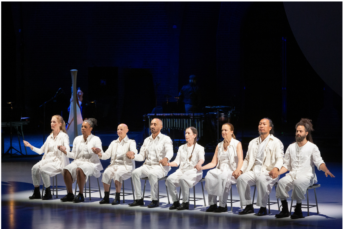
Meredith Monk & Vocal Ensemble, Indra's Net (2023), co-presented by Holland Festival and Hartwig Art Foundation.

"In a world so fragmented and full of sadness, I want to create work that affirms life and our sense of connection to each other and all living things." – Meredith Monk