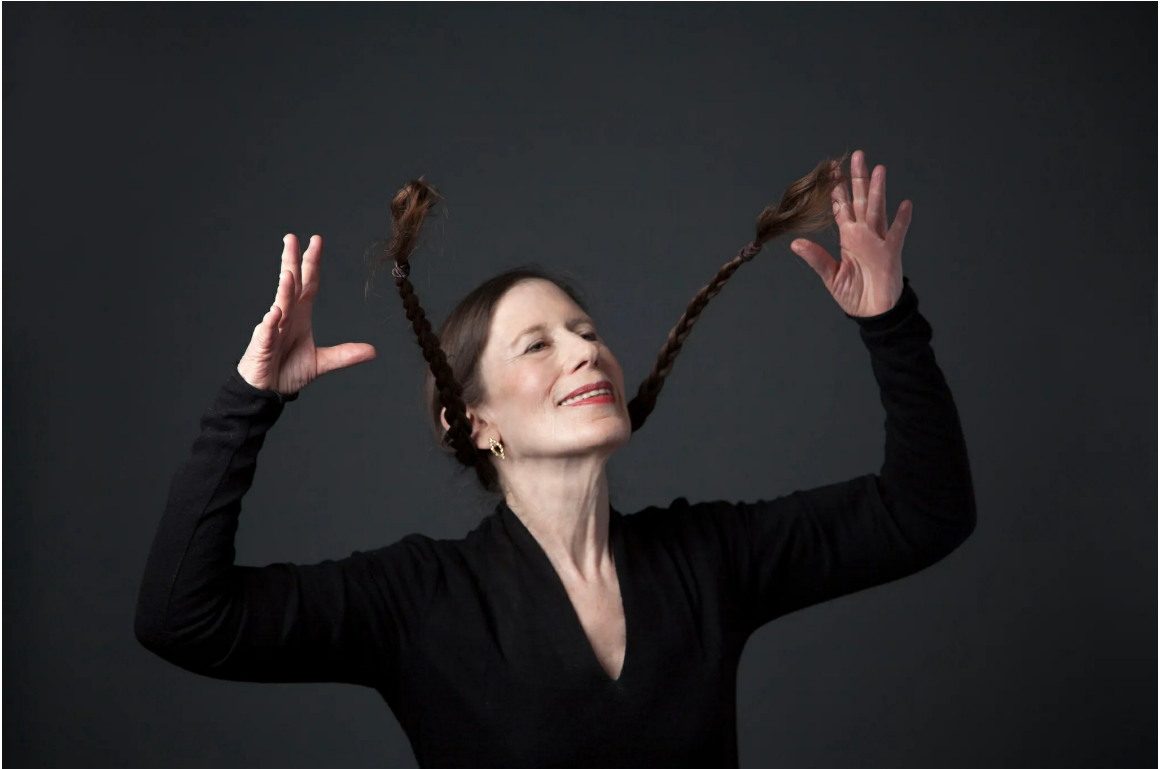
Meredith Monk