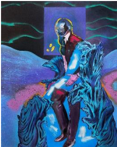
Davide Serpetti L'avvocato / The Lawyer , 2023 olio, acrilico e spray su tela 192 x 136 cm

In the last years, Davide Serpetti's research focused on the sculptural possibilities of painting, mixing human and animal-like forms. Exploring in particular the symbolic figures of the hero and the beast, Serpetti creates spatial, untimely compositions where every element is visually portrayed without any sense of perspective.