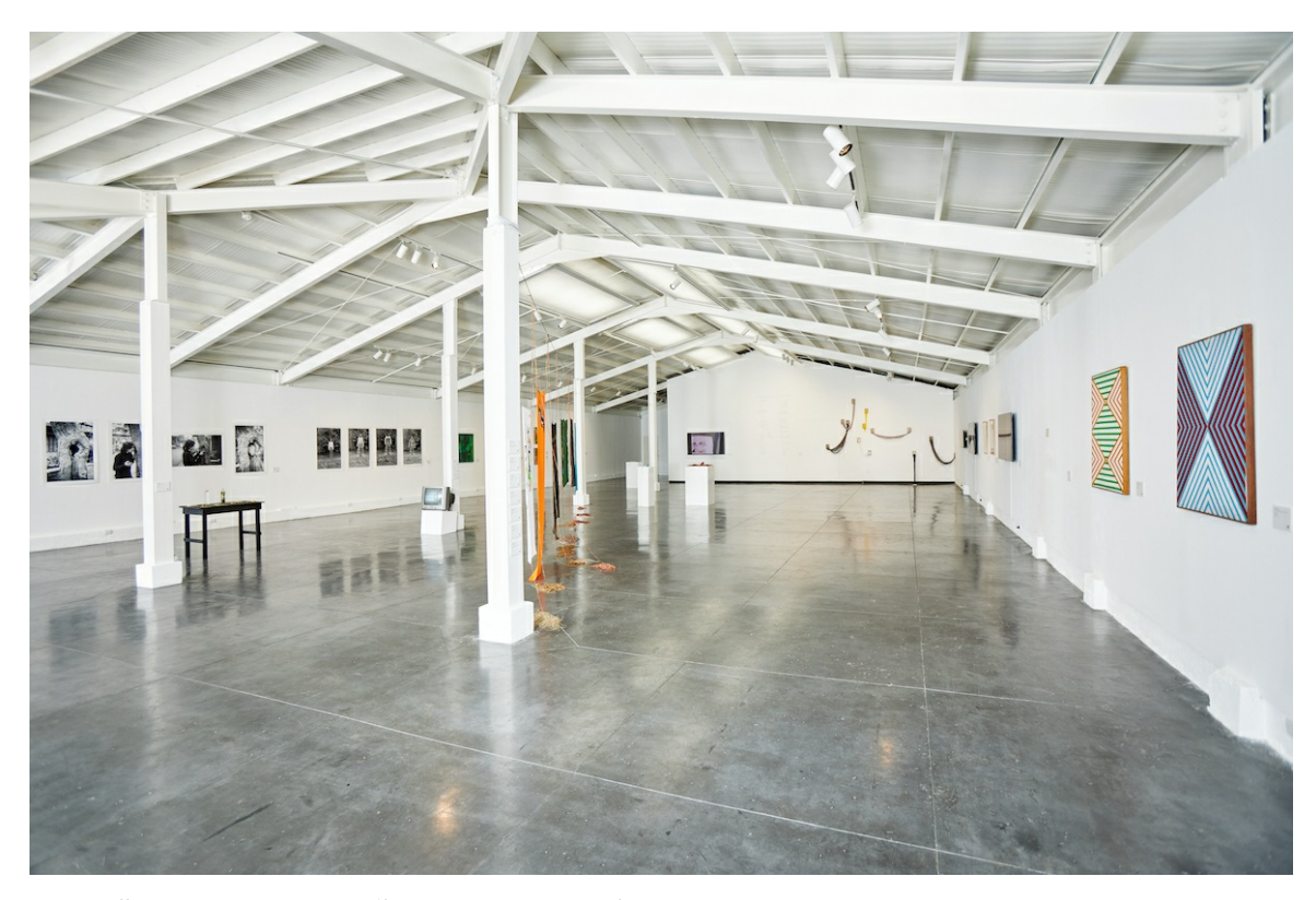
Installation view at La Nueva Fábrica, Antigua Guatemala.

*The project's title is a verse belonging to the poem Nací mujer (I Was Born a Woman) by the writer and poet Maya Cú