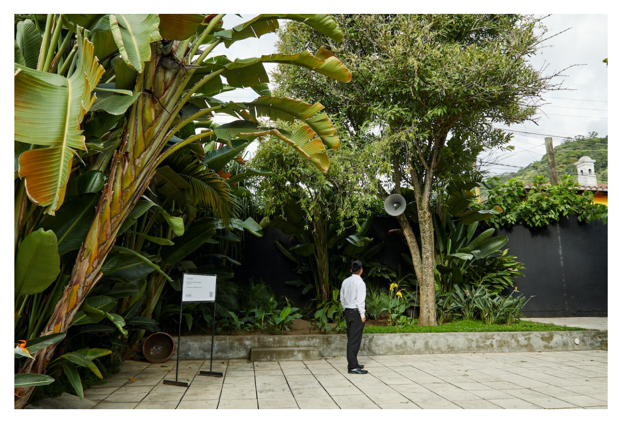
Installation view at La Nueva Fábrica, Antigua Guatemala. Photo: art direction, Karen Bethancourt; production, Byron Mármol. Courtesy of Fundación Paiz.

Copyright © 2023 Pickles PR, All rights reserved.