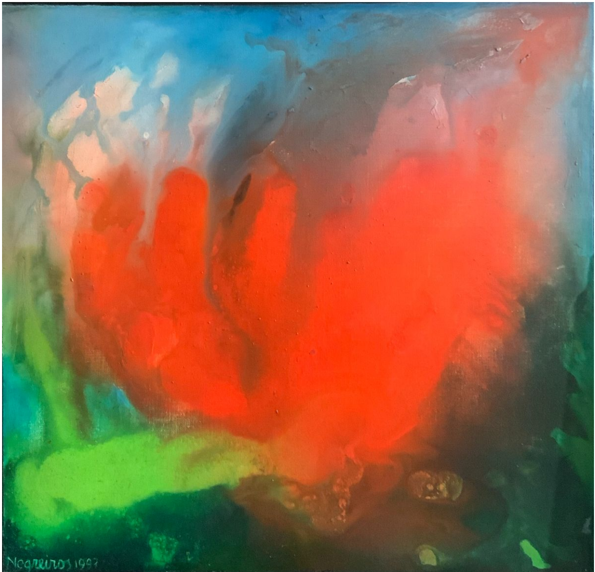
Image: María Thereza Negreiros, Incendio Amazónico (Amazon Fire) , 1997, Óleo sobre lienzo – Oil on canvas, Colección de la artista – Artist's collection.