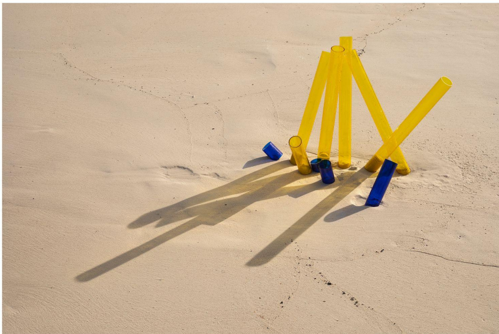
Ilán Rabchinsky, Position and Trajectory , 2022. A project for Maroma, A Belmond Hotel