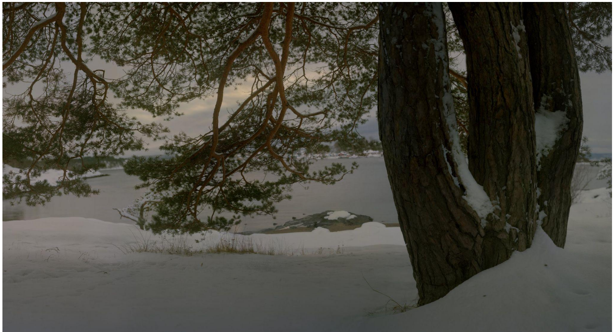
Mikkel McAlinden, Hovedoya , 2022, inkjet print.

Persons Projects (Berlin) are showing a selection of artists from the Helsinki school whose varied perspectives on how to depict nature and landscape reveal photography's potential as a conceptual tool for thinking. Crane Kalman Brighton and Eleven Fine Art (Twickenham) are teaming up to showcase the works of three female photographers whose approaches to landscape photography varies from real, to imagined and fantastical; while at Alessia Paladini (Milan) the group presentation 'On Landscape' will feature works by five women photographers from across the world whose works are connected through the red threads of memory, recollection of the past, change and resilience. The relationship between landscape and memory is also a feature of Los Angeles-based artist Jessie Chaney's evocative images of abandoned civilisation from her series 'Memories of a Space' on show at FabriK Media (Los Angeles); while Bildehalle (Zürich) mounts a group show on the topic of memory and remembering in photography.