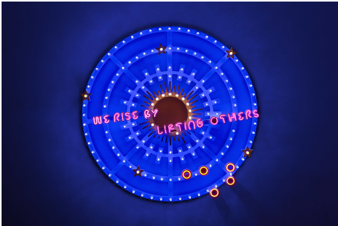
Image: Oliviero Toscani, Untitled , 1991.

created by the Maison with ten of the most famous photographers in the world.