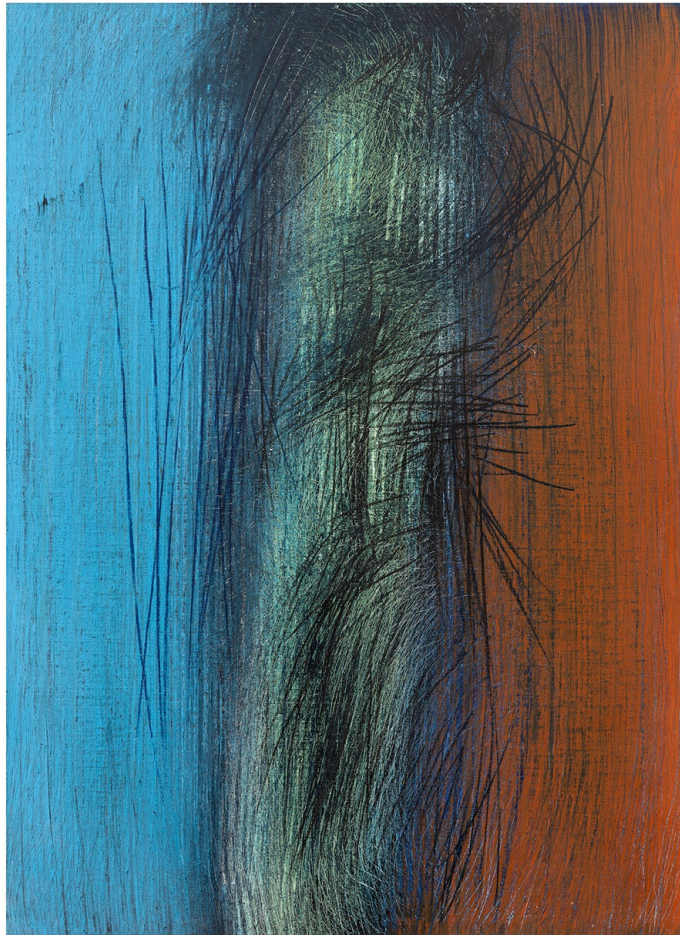
Hans Hartung, T1963-E10 , 1963 Titled (on the stretcher): "T1963-E10"

The sculpture by Fausto Melotti , Disegno nello spazio (1981), complements the sculptural presentation with thin threads of brass. The weightlessness of its filiform and fragile structures 'draws' in the space, creating a harmonious composition of cosmic inspiration.