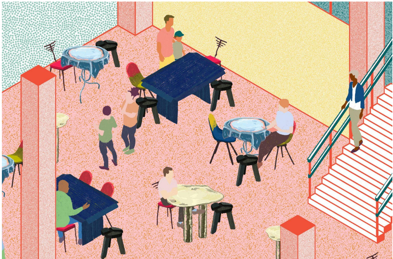
Sketch for Six Dots Design Localist Café by Olena Oliinyk @lenlenstrations_

https://shoreditchartsclub.com/events/six-dots-london-design-festival