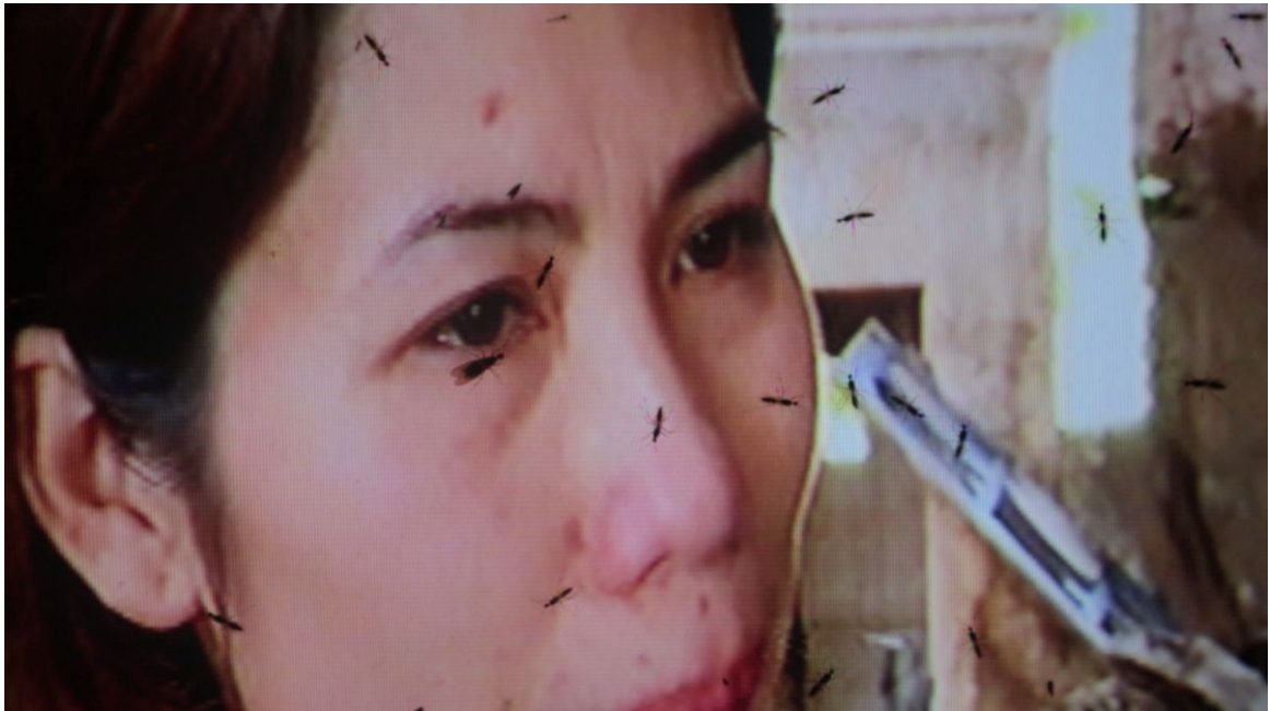
Image still: Dance of the Insect, Single channel video, 2020, 15 minutes 20 seconds